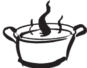
Authentic Pastas & Oils